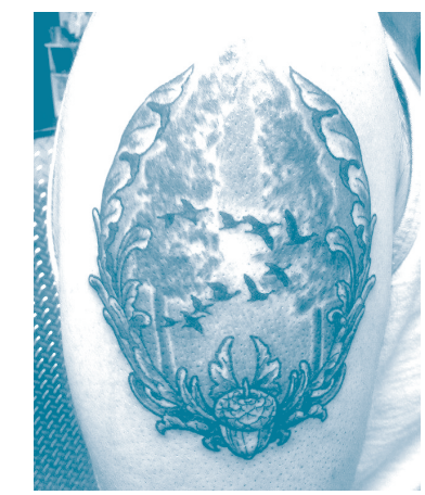
This year's theme and poster resonated so much with one participant that they had the artwork tattooed on their arm.