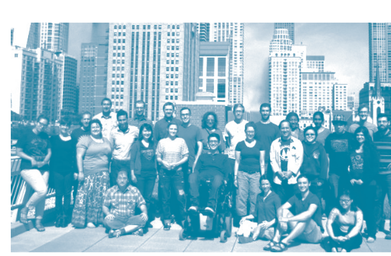
The Chicago sky-line, accompanied by all three of the NASCO Family Boards at a leadership summit in June 2014

NASCO Properties completed a year of planned growth, with the board considering proposals from seven cooperatives applying to join or expand through NASCO Properties. The board chose two of the seven proposals, adding a new cooperative in Athens, OH, and working towards the acquisition of a new cooperative in Lawrence, KS. Several other existing cooperatives applied to be part of the NASCO Properties through the Request for Proposals, and several of these will work with NASCO to purchase property independently.