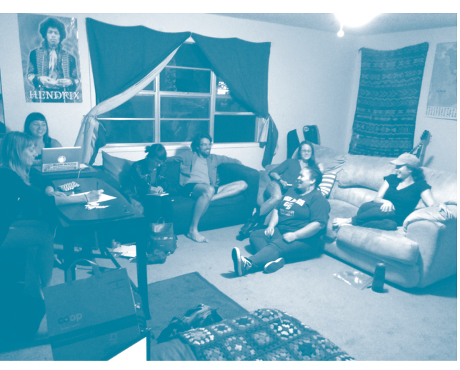
Co-op members developing their facilitation skills in a workshop with NASCO staff