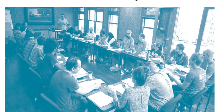
A "field of magical unicorns" as one participant described the 2015 Staff & Managers Conference