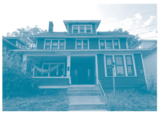
Firehouse, the newest member of the NASCO Family, in Athens, OH