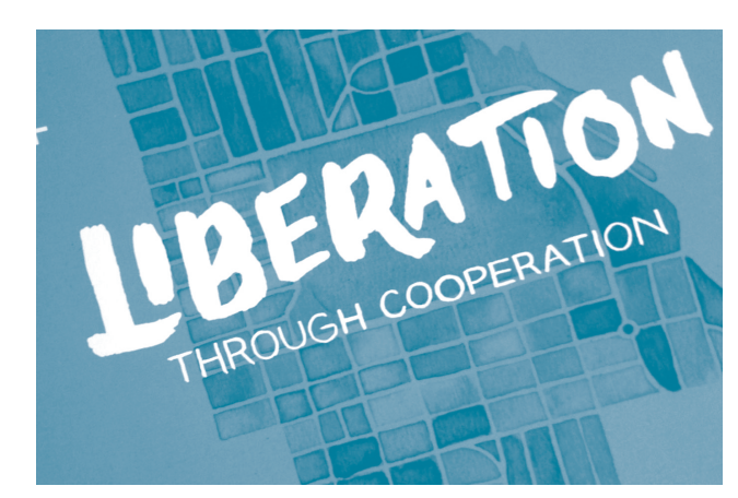
Poster from WestCo 2015, "Liberation through Cooperation," which was held in Berkeley, CA