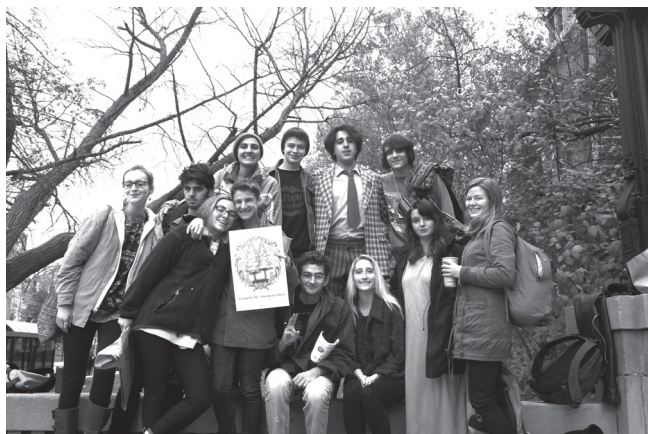
A group of co-ops from the Genesee Valley Cooperative working with NASCO staff on co-op development