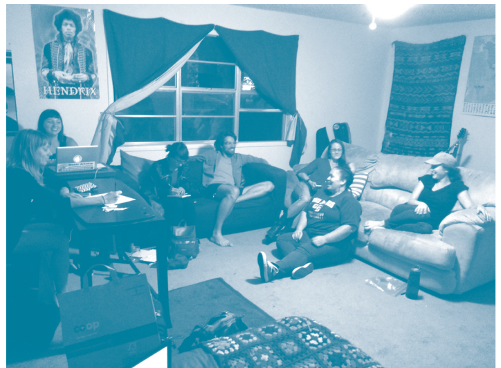
Co-op members developing their facilitation skills in a workshop with NASCO staff

In 2015, NASCO's staff spent nearly 1,500 hours on direct services to NASCO member cooperatives. Most of this time was spent on-site, visiting NASCO members to learn about their cooperatives, connect them to other cooperative resources, and provide trainings or consulting. We visited 40 co-ops, including 33 NASCO members.