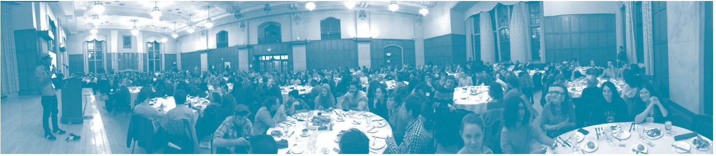
A sea of co-ops fills the ballroom at the NASCO Institute 2014 Banquet & Hall of Fame