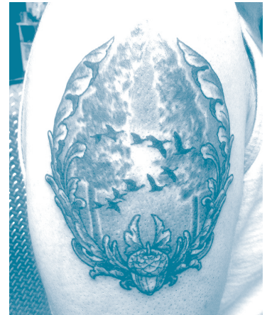
This year’s theme and poster resonated so much with one participant that they had the artwork tattooed on their arm.