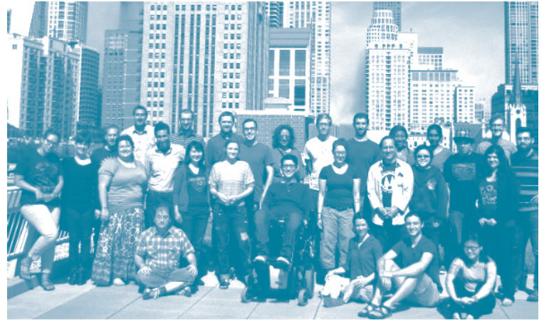
The Chicago sky-line, accompanied by all three of the NASCO Family Boards at a leadership summit in June 2014

30 people from all three boards and NASCO staff gathered for a one-day leadership summit in Chicago in June 2014. This was a full day of opportunities for members of the boards to meet each other and begin the visioning work that will lead to the creation of a new strategic plan in 2016.