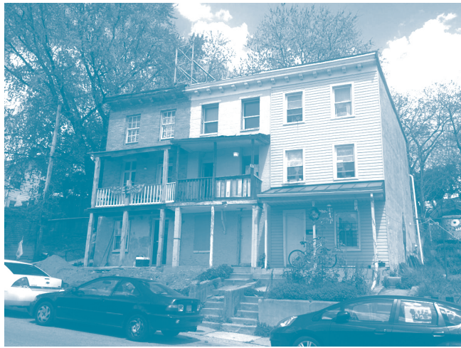
Horizontal Housing now controls all three of these adjacent row houses.