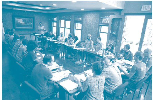
A “field of magical unicorns” as one participant described the 2015 Staff & Managers Conference

These videos are broken down into short modules for easy watching! Check them out at: www.nasco.coop/resources