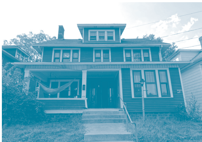
Firehouse, the newest member of the NASCO Family, in Athens, OH