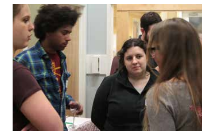
Co-op staff and managers connecting with Boulder city officials during the 2016 Staff & Managers Conference.

In 2010, NASCO contracted with Unitarian Universalist Community Cooperatives to purchase their first house. Through our development and educational assistance, the co-op leadership was well prepared to purchase a second property in 2016. Along with other fundraising, they also received a $100,000 award from the Forbes "Change the World" competition, allowing them to acquire and renovate a property for 18 residents, now known as Margaret Moseley Co-op.