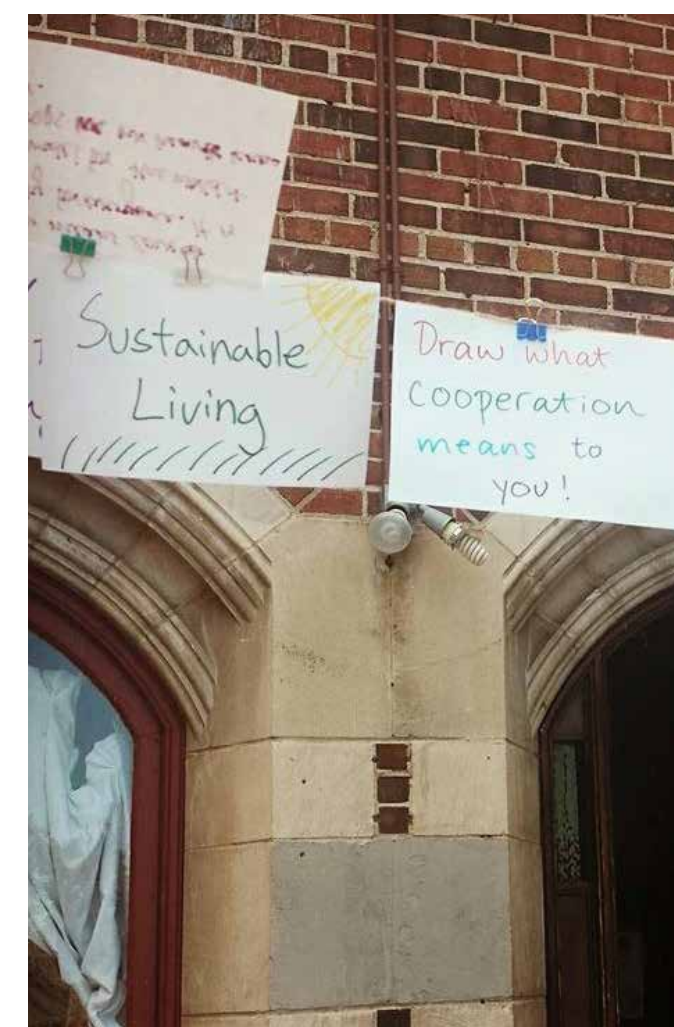
At a community potluck hosted by the Boulder Housing Coalition, members of the NASCO Board, the broader Boulder co-op community, and the Boulder City Council met to discuss what "cooperation" means to them and what increased cooperation would mean for Boulder.

Cooperative Development Institute Federation of Egalitarian Communities Philadelphia Area Cooperative Alliance UMass Center for Student Business UTILE