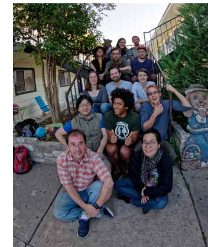
The NASCO Properties Board in February 2016 at La Reunion in Austin, TX.