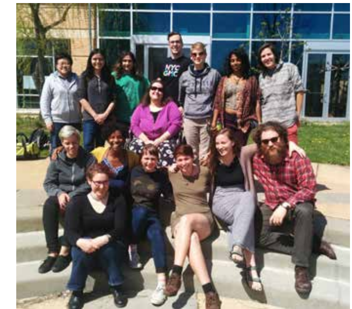
The NASCO Board in April 2016 at Oberlin College.