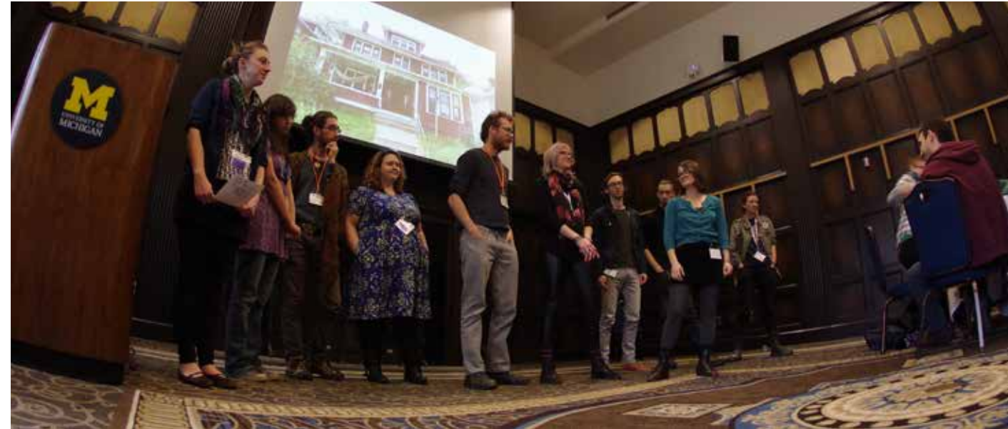
NASCO Properties members gather each year at NASCO Institute to share updates from their co-ops.

Remote technical assistance: in-depth assistance and consulting to member co-ops on an as-needed basis